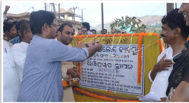
Illumination of decorative LED light at New Bus Stand, Bisra Chowk, Rourkela, by Sri Pushpendra Singh Deo, Hon'ble Minister, Housing & Urban Development, Odisha