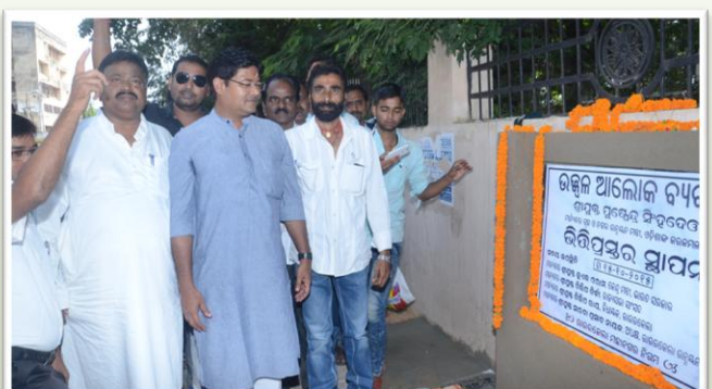
Foundation of decorative LED Street light of Ambedkar chowk to Employment Exchange, Udit Nagar, Rourkela by Sri Pushpendra Singh Deo, Hon'ble Minister, Housing & Urban Development, Odisha